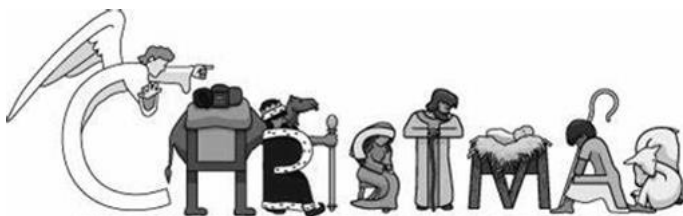
CHRISTMAS IS THE CELEBRATION OF THE BIRTH OF JESUS, THE SAVIOUR OF MANKIND